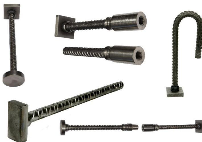
Figure 1 Examples of HRC products: HRC100 Series T-headed bars, HRC400 Series rebar couplers, and HRC720 threaded sleeves

The rebar is cut to length according to the production order. Small, unusable cut-off lengths are collected and sent to recycling. The raw material for end-components is cut to correct length/geometry. Threaded components (rebar couplers and cast-in connections) are processed by CNC-machines. Small, unusable cut-off lengths and swarf from cutting and CNC-machining are collected and sent to recycling. The end components are attached to the rebar by friction welding. The process uses no additional material or consumables. If required by the production order, products are bent by a rebar bending machine.